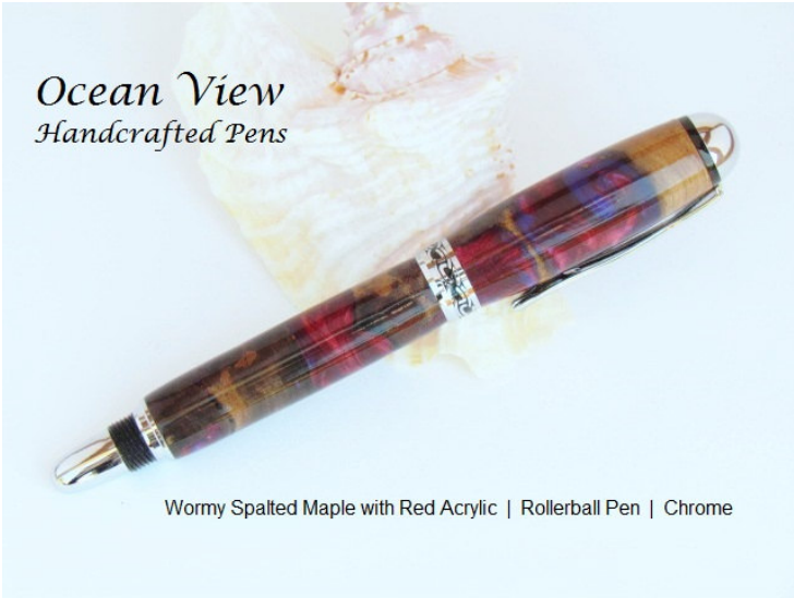
Wormy Spalted Maple with Red Acrylic | Rollerball Pen | Chrome